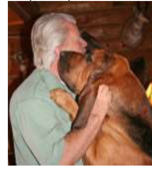
They like to Jump on you