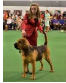
They can be Show Dogs