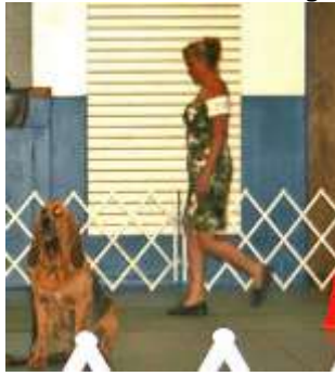
Do Rally or Obedience