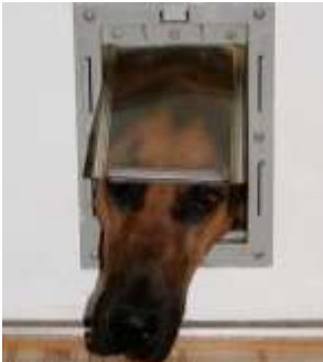
Bloodhounds are Nosey