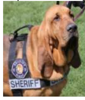
They can be Police Dogs