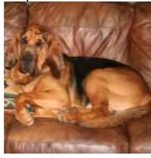
They love your Furniture