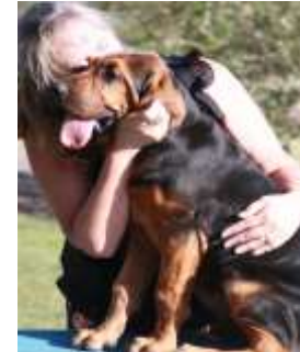
They can be Good Dogs