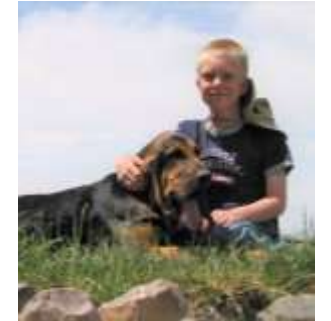
Usually Good with Kids