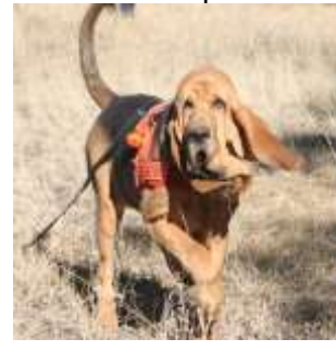
Search & Rescue Dogs