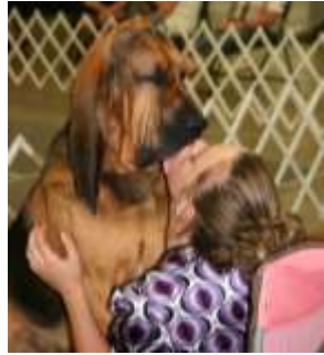
Bloodhounds are Loveable