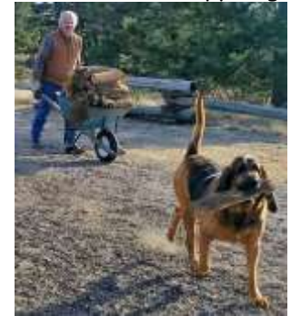
Or just a great Family Dog!