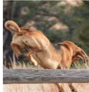
They're Active & Athletic