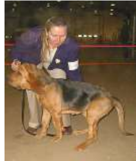
They can be Stubborn