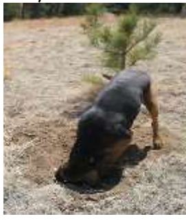
They also like to Dig