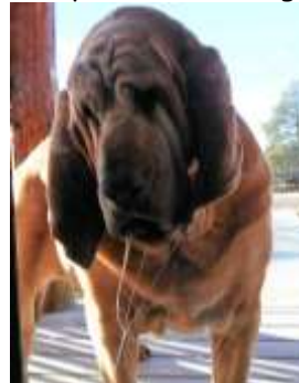
They are Messy & Drool