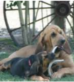
Bloodhounds like to Chew